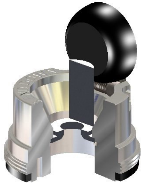
Insert Float Fill-Up Valve Type 904 F